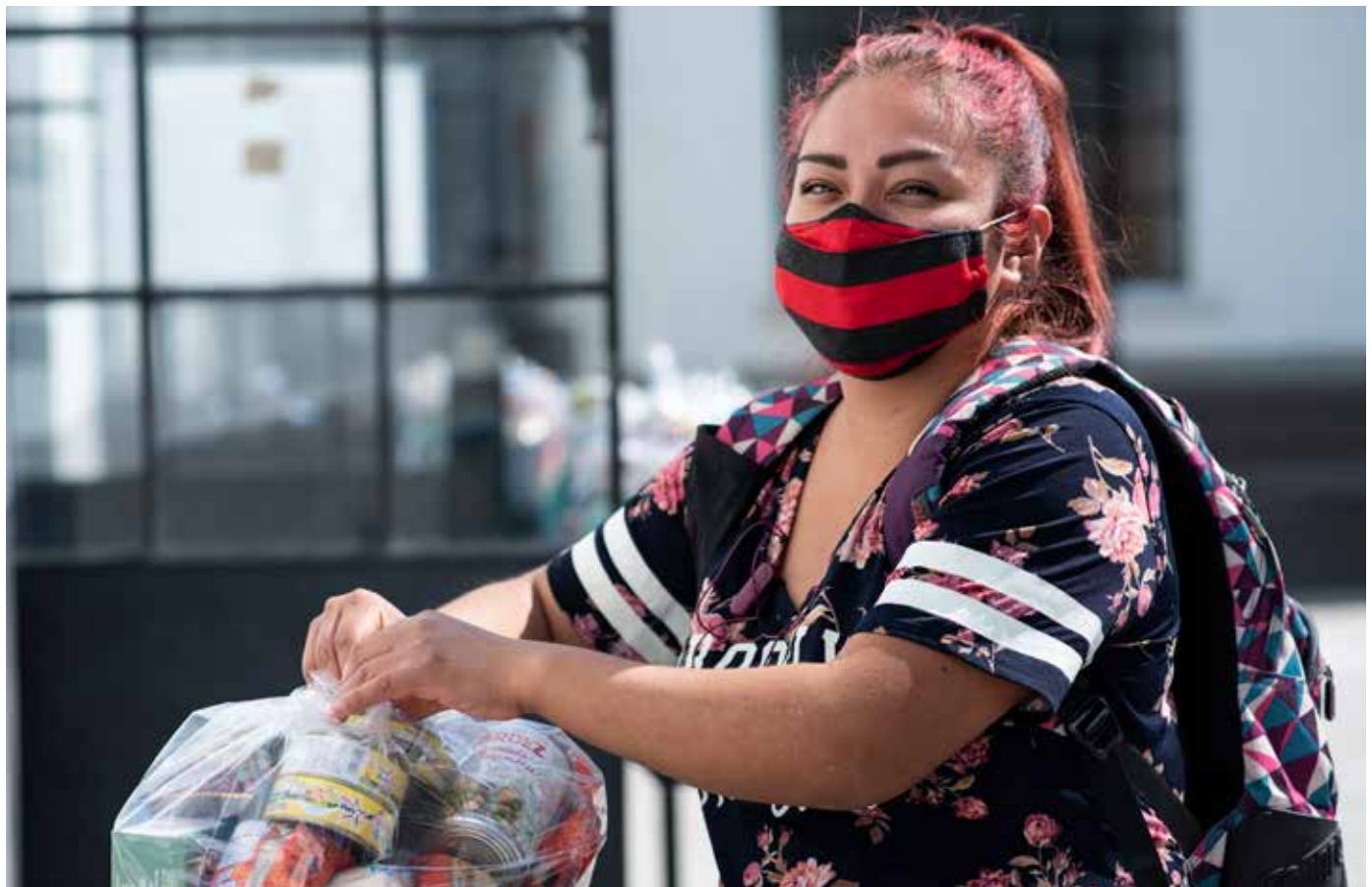
In the first weeks of the pandemic, families picked up food and critical supplies at Christel House Mexico.