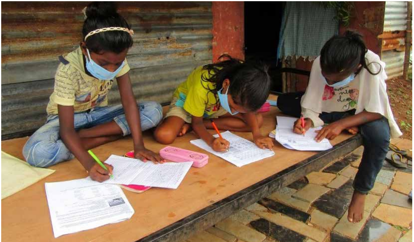
When schools closed, students continued to learn remotely with homework packages provided by Christel House teachers.