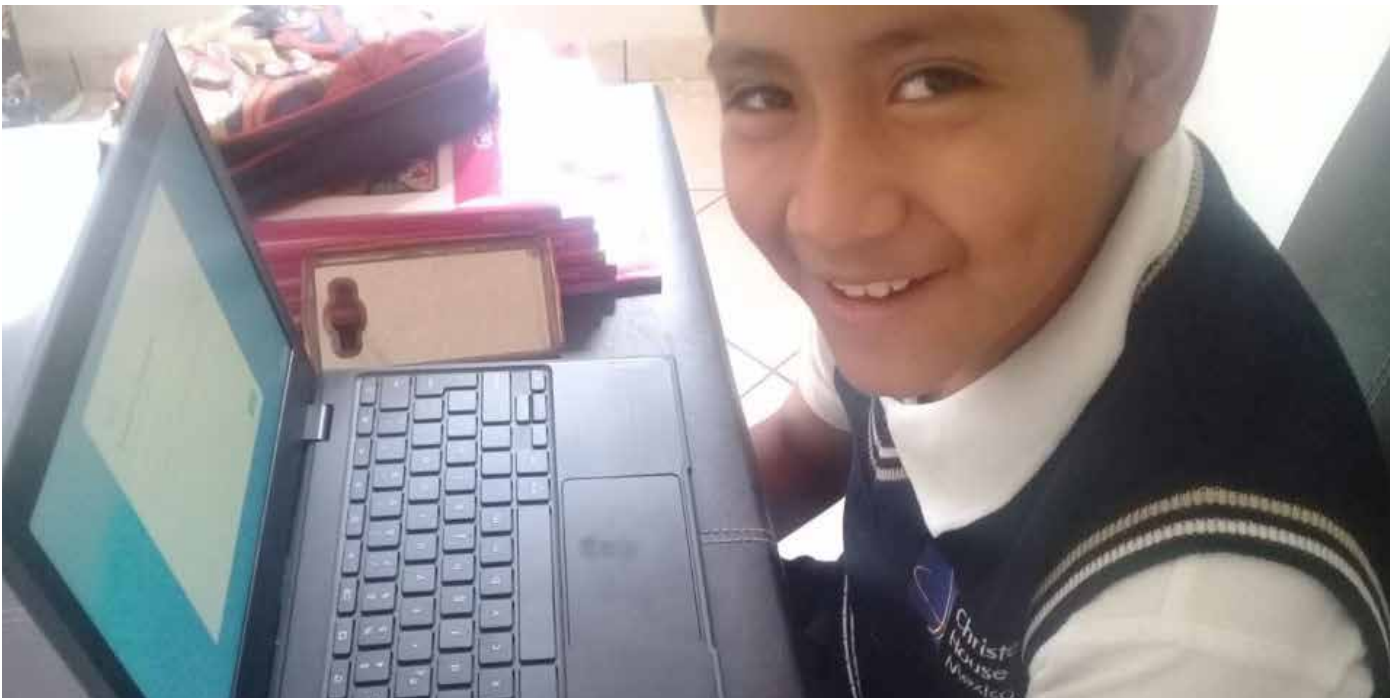
Christel House Mexico students study from home, connecting to teachers with devices and data provided by the school.