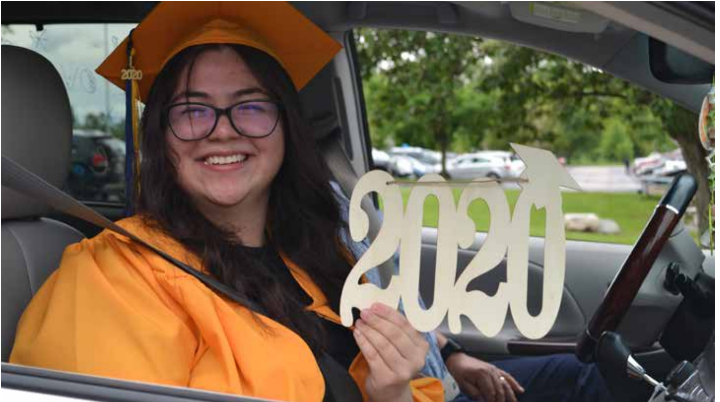
Families, teachers and staff in Indianapolis saluted the Class of 2020 in an end-of-year parade for graduating seniors.