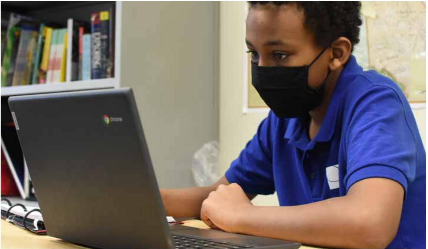
Bridging the digital divide was critical this year as students use technology in the classroom and at home.