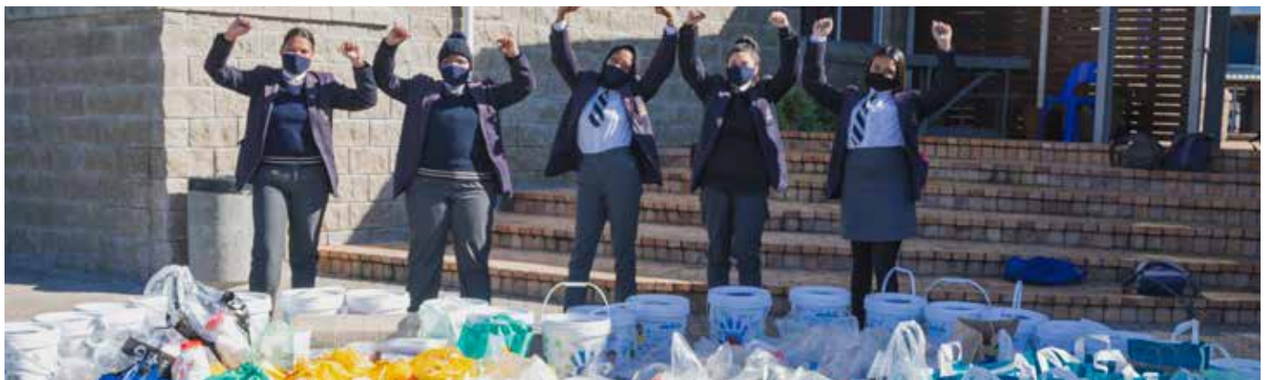
As part of Nelson Mandela Day activities, Christel House South Africa students collected supplies for families in need.