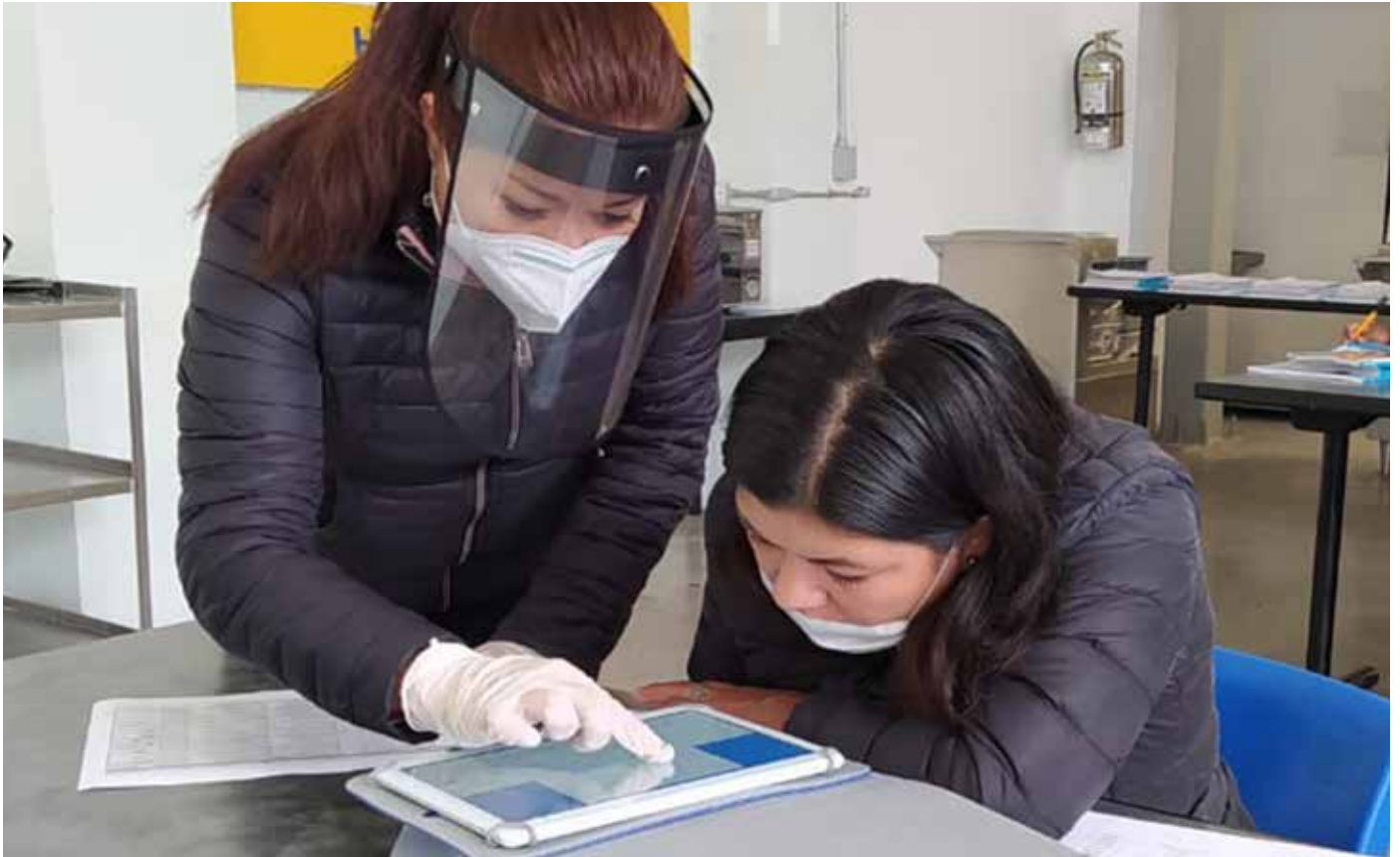
Parents receive lessons on how to operate the devices that their children will use for remote learning.