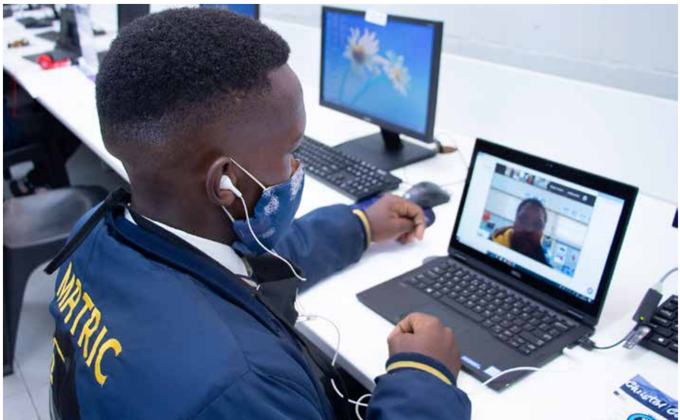
To prepare for getting a job, Christel House South Africa students participate in interview drills with HR Directors.