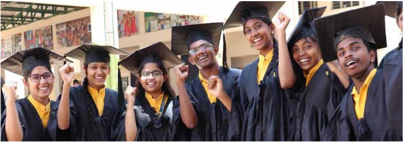
Christel House India students celebrate graduation, only weeks before schools closed due to the pandemic.

KisanKraft Foundation Nokia Oyj Nutanix Technologies India Pvt Ltd The Perse School & Perse School Parents Association Talisma Corporation Pvt. Ltd.