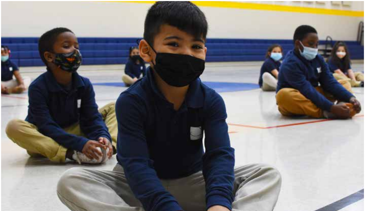
Kids stretch during gym class at Christel House Academy West in Indianapolis. Students follow safety protocols for in-person classes.