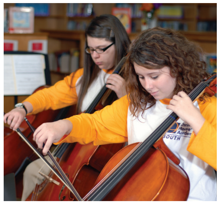
Christel House Academy South students in strings class.