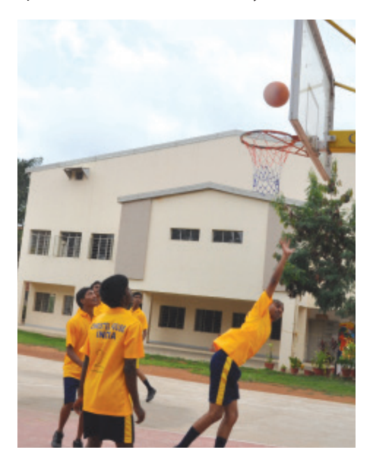
Christel House India-Bangalore students at basketball practice.