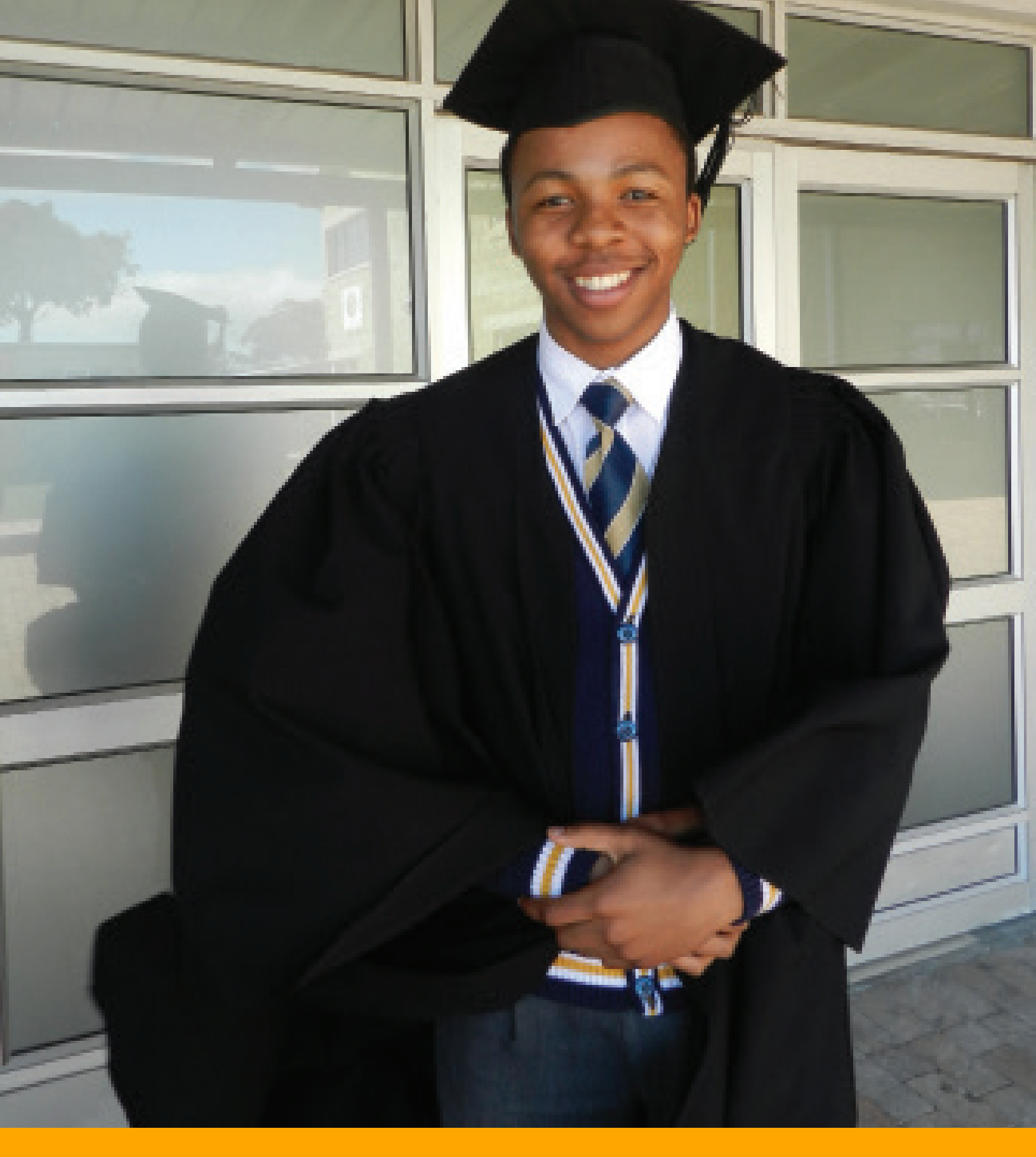
"I learned to give not because I have much, but because I know exactly how it felt to have nothing."—2011 CHRISTEL HOUSE SOUTH AFRICA GRADUATE, FACEBOOK POST