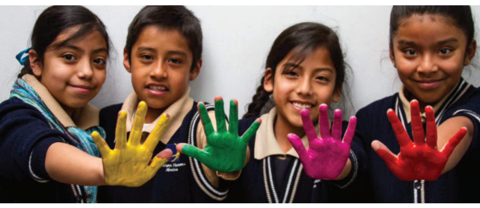
Christel House Mexico students in art class.