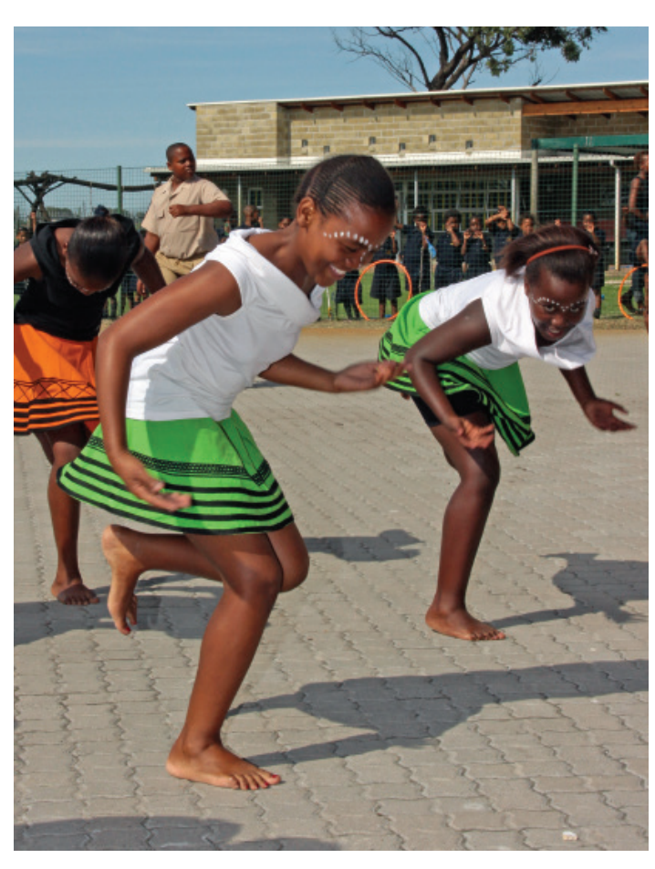
Christel House South Africa dance team.