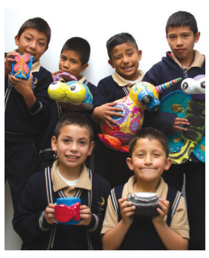
Christel House Mexico students showing off their pottery and sculptures.