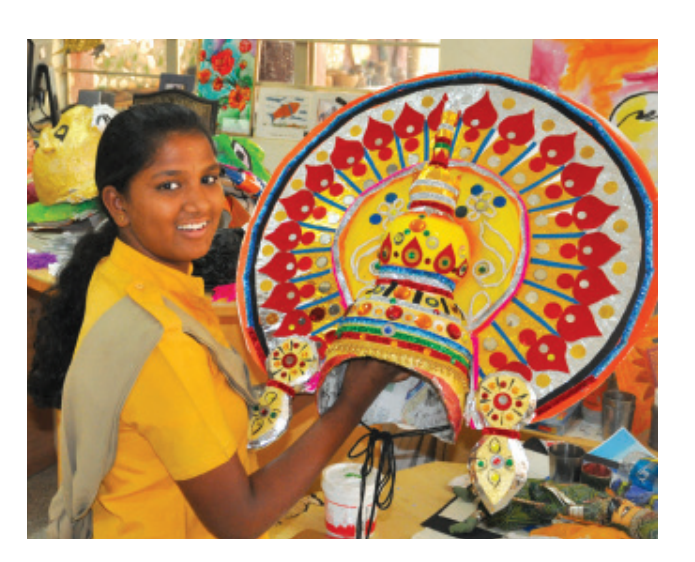
Christel House India-Bangalore student with the hand-painted headdress she made for a school drama production.